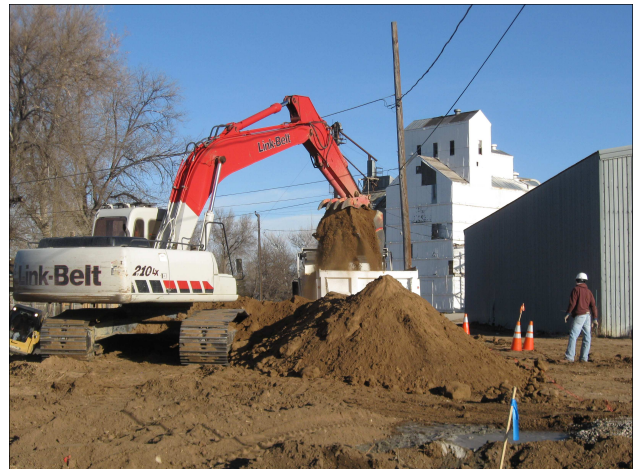
NRE Excavating moving dirt

We invite you to view the progress up close. Our General Contractor, FCI Constructors, worked with us to install chain-link security fencing, vice a solid wall, so that Milliken taxpayers can see what they are getting. Please feel free to come down and watch the activity from the safety of Ethel or Frances Avenues.